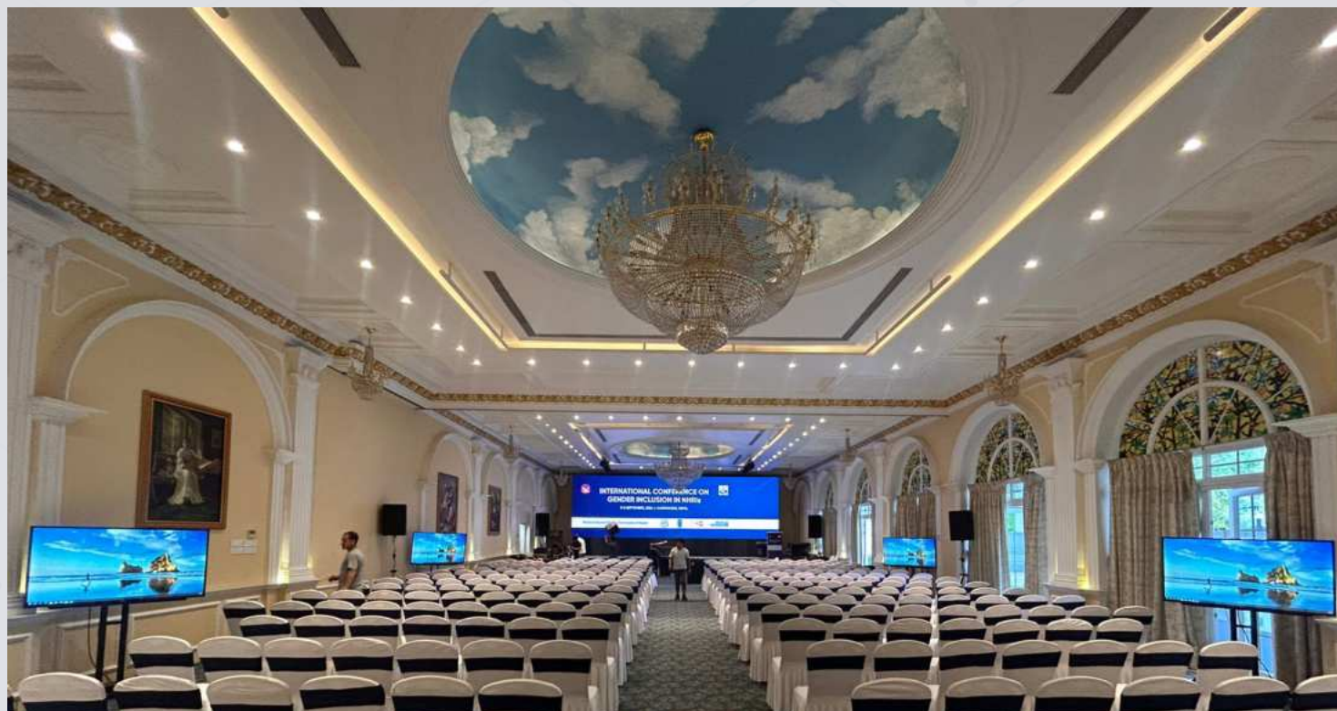
Conference Hall, Park Village Resort